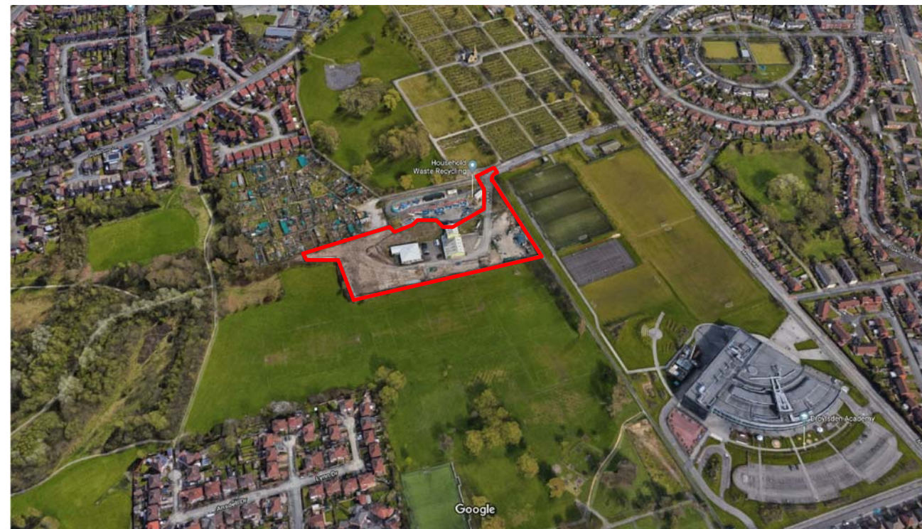
BIRDS EYE VIEW FROM WEST