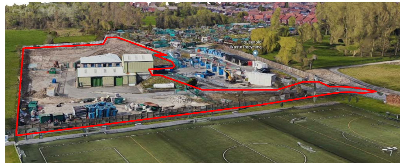
3D VIEW OF THE SITE FROM SOUTH